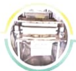
Automatic Honey Comb Foundation Machine