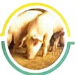
New Cross in Piggery