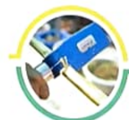
Peelo Cut Hand Tool