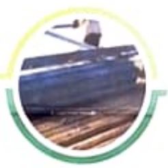
Roller for Sowing vegetable seeds