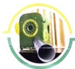
Flower Rain Machine