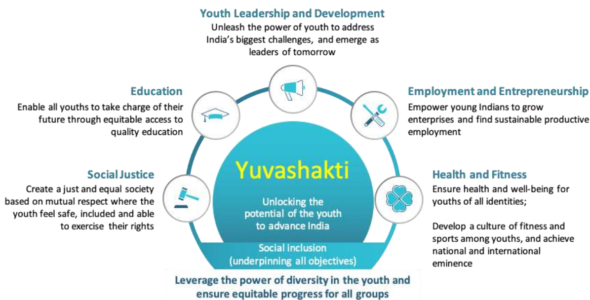
Exhibit 2: Vision and objectives of NYP 2021