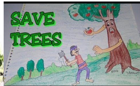
Harm me not