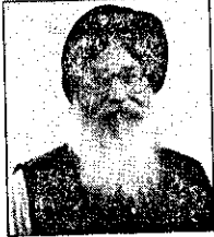
S. Parkash Singh Badal Chief Minister, Punjab